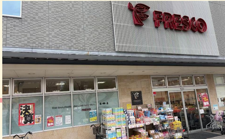
supermarket: 600-8311 Kyoto, Shimogyo Ward, Bishamoncho, 33-1